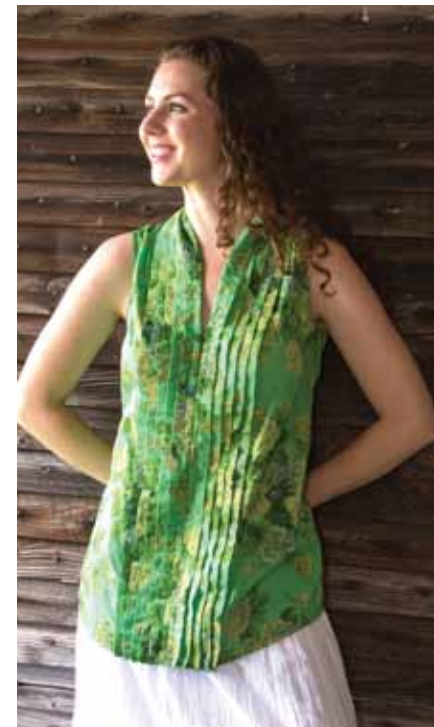
claudette blouse The Claudette Blouse is a great alternative as an everyday piece, it's super comfortable and looks beautiful. Perfect for wearing to church or to lunch, to work or for a nice dinner, it's versatile, feminine and flattering. Four 1/4 inch pleats on either side of the button front and a neck elongating mandarin collar are all this piece needs besides its great shape. Imported cotton. BLA5089Y XS-XL $69