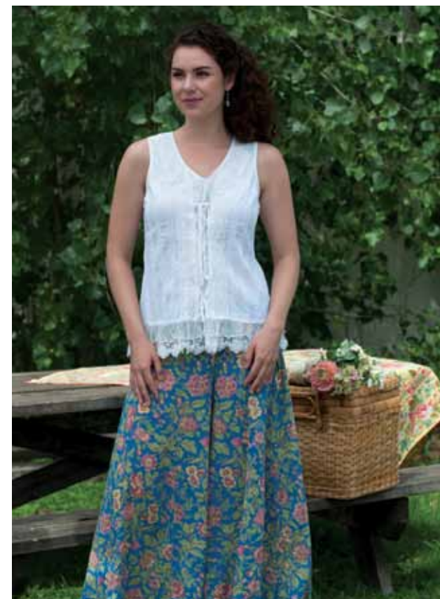
odette pant Featuring one of our most vibrant and lovely prints for the season, the Odette Pant seems to spring to life, fueled by a tremendous combination of color and fabric. Created especially for the free artful spirit, this wide legged style truly makes you feel exceptional. Imported cotton. PTA5098Y XS-XL $119