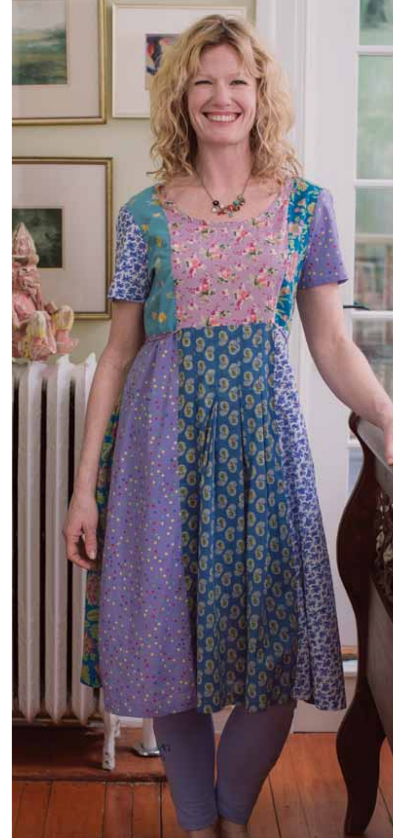
joni dress A carefree, joy filled style for a carefree, joy filled girl! Just right for a woman who still has a little "flower child" inside her and isn't afraid to show it. The Joni Dress is a tour de force, boasting no less than six of April's peerless, smile-inspiring floral prints for the season. Fabric tie. Imported cotton. DRA5172Y XS-XL $89