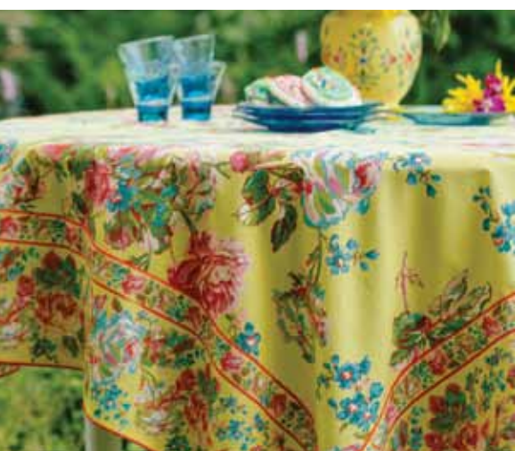
victorian rose tablecloth in yellow TPVICY 36x36" $24 54x54" $46 60x90" $64