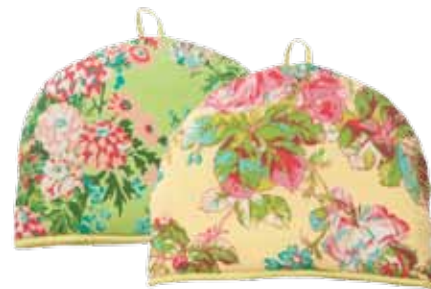
festival patchwork tea cozy Reversible. TCFESY $14