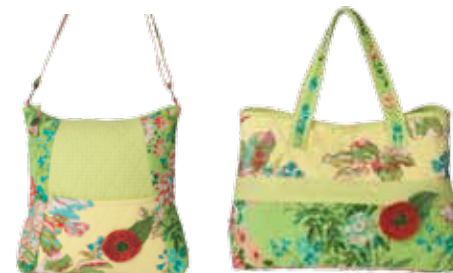
festival patchwork crossbody and small craft bags Tote in style! Quilted and embellished, the Festival Patchwork small craft bag is the perfect cheerful blend of our finest plaids and prints. The crossbody bag has a zipped closure and an adjustable strap. The small craft bag has matching, sewn on handles. Imported cotton. BGCSFESY small craft bag $49 BGCBFESY crossbody bag $74