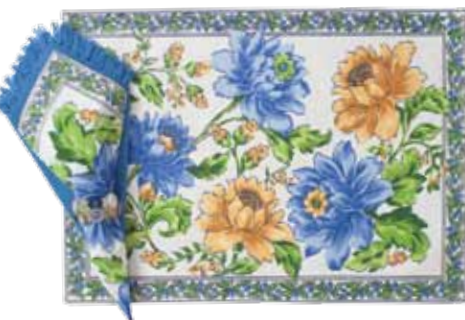
rosehip placemats in ecru Sets of four. MPRHPY placemats $38 NPRHP20Y napkins $29 NPESS18Y essential napkins in periwinkle $22