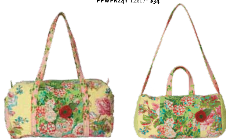
festival patchwork duffles Perfect for weekend trips, the small and large duffles are beautifully quilted and embellished with trademark floral applique. The small duffel has a rounded body; the larger duffel a square. Imported cotton. BGSDFESY small 16w x 9h x 9d" $64 BGDBFESY large 20w x 11h x 9d" $79