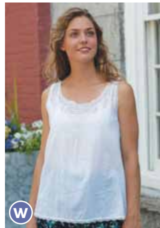
delicate camisole in white The Delicate Camisole is one of the timeless, feminine garments that April has been designing for the past forty years. Trimmed at the neck, shoulder and hemline with crochet lace and inset with bands of embroidered lace on the bodice, this tender garment looks great with leggings or worn as an undergarment. Imported cotton. CMAA5113Y XS-XXL $59 W1-W2 $69