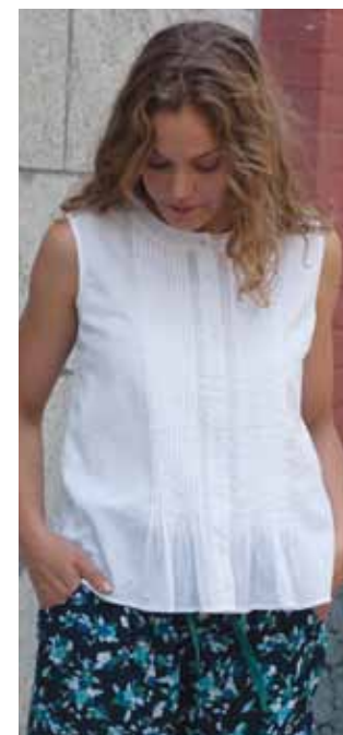
forever camisole Fall in love for ever after with the Forever Camisole! Made in beautifully soft pure Indian cotton, this item is great as a topper as well as just on its own to create a smart, casual look with jeans or leggings. Of course, it wouldn't be complete without our signature design touches like the ten tiny tuxedo pleats on either side, as well as the form flattering ruffles below. Imported cotton. White. CMA5096Y XS-XL $59