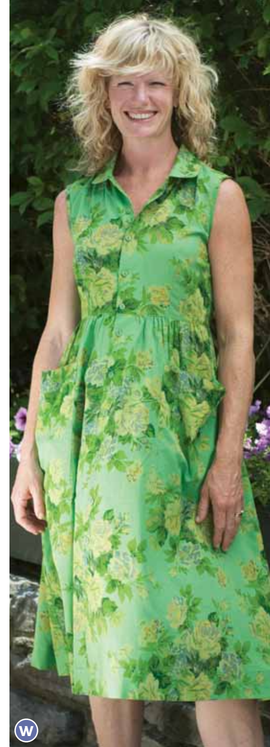
claudette dress Our vintage 1940's house dress styles are so wonderful that once you wear one you won't want to wear anything else. Pretty and comfy, the Claudette is a cool cotton dress tailor made for hot days and starry nights. Big patch pockets are a great feature of this easy to wear feminine piece and the fabric tie is all you need to achieve just the right shape. Imported cotton. DRAA5190Y XS-XXL $89 W1-W2 $99