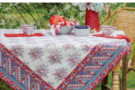
marseille in red TPMASY 36x36" $24 54x54" $46 60x90" $69