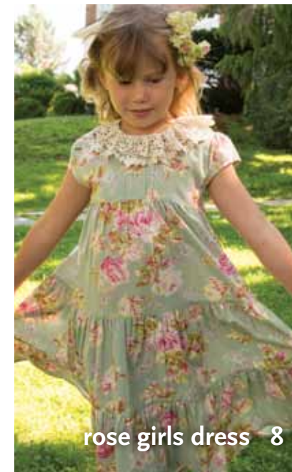
rose girls dress 8

In India, where our factory gives us so much beautiful product, so much craft and skill, we give back with every item we make to those in need. We also support a variety of fundraising events and such charitable organizations as Concern India. For more about our giving back, visit us at www.givingworldfoundation.org