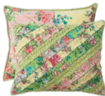
festival patchwork cushion Front & back shown. CPRFES18Y 18x14" $39