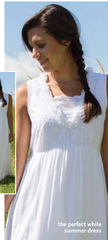
the perfect white summer dress