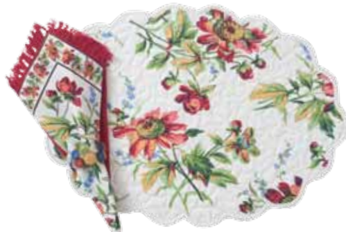
friendship quilted placemat & napkins in ecru Sets of four. MPQFRDY placemat $48 NPFRD20Y napkin $29 NPESS18Y essential napkin in red $22