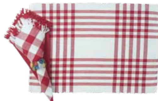
happy picnic gingham placemat and napkins in red Sets of four. MPWHAPY placemat $32 NPWHAP18Y napkin $26 NPESS18Y essential napkin in red $22