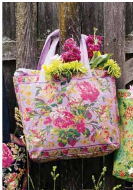
victorian rose market bag in lavender Perfect for strolling from the farmer's market to the coffee shop and back again, our Victorian Rose market bag is light, easy—just like carrying a bouquet with you everywhere you go! Made in 100% imported cotton canvas for durability with matching solid canvas straps. BGMVICY $27