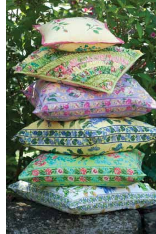
rose garden embroidered cushion in yellow CPERGA12Y 12x12" $39

rosehip paper placemats—when you have more guests than placemats Paper placemats are ideal for bringing the beauty of designer prints into your home with easy clean up. Each packet contains two original prints and a total of 24 tear off placemats. PPCFR24Y 12x17" $34