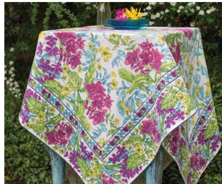
veranda tablecloth in ecru TPVERY 36x36" $24 54x54" $46 60x90" $69 88" round $89

peony jacquard in green TPWPEOY 54x54" $56 60x90" $89 60x108" $99