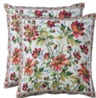
friendship cushion cover in ecru Insert sold separately. (See page 45.) Front & back shown. CPMRD20Y 20x20" $24

"There is nothing that makes me happier than sitting around the dinner table and talking until the candles are burned down."--Madeleine L'Engle, A Circle of Quiet. And why not do so comforted by one of our gorgeous, hand screened, limited quantity, artistically printed tablecloths? Or one of our hand-loomed, 100% imported cotton checks. A little bit of red, a touch of white and beautiful. Each piece—tablecloth, cushion cover, napkin--uses a unique design for screening the main image and borders.