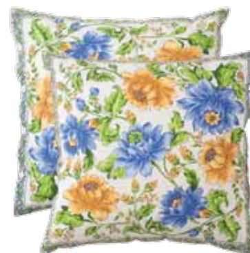
rosehip cushion cover in ecru Front & back shown. CPRHP20Y 20x20" $24