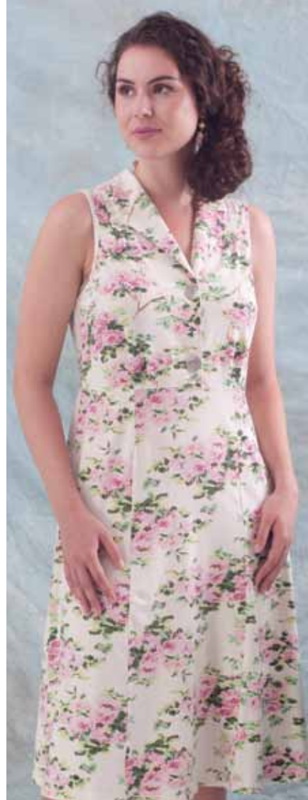
bouquet dress One of our timeless French-inspired feminine, floral prints meets gorgeous 1940's styling in the Bouquet Dress. Oversized mother-of-pearl buttons adorn the bodice and run to the natural waistline of this easygoing beautiful frock that falls just below the knee. Sumptuously soft and perfect for day or night. Imported cotton. DRA5082Y XS-XL $104