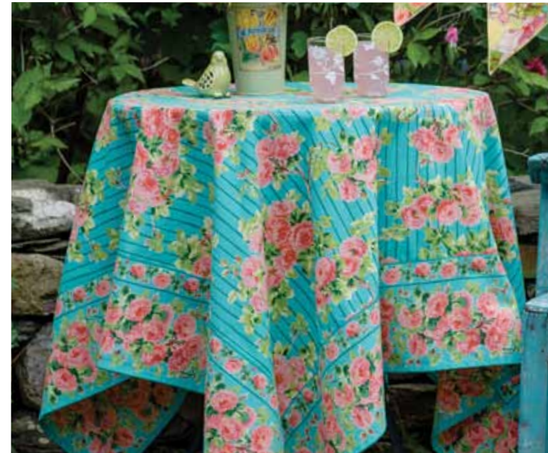
roses on stripe tablecloth in aqua TPROSY 36x36" $24 54x54" $46 60x90" $69