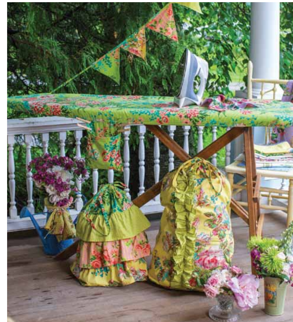
festival patchwork & zinnia garden prints move into the laundry The colors found in our Festival Patchwork and Zinnia Garden prints announce Spring and Summer's arrival in bright lime greens, blazing yellows, brilliant reds and rose with hints of lush dark true green. Imported cotton.