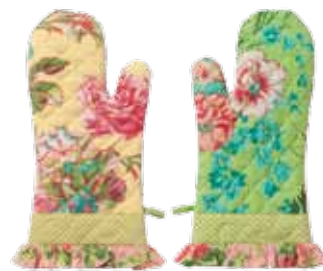
festival patchwork ovenmitt Front & back shown. OVFESY $18

A floral festival of our fabulous prints for the season, the Festival Patchwork Collection combines no less than five of our favorite, originally designed artworks. These pieces are for the connoisseur of color who loves the vibrant aesthetic embodied in our products and loves the effect they kindle in the home. Imported cotton.