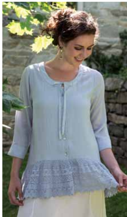
emma blouse The Emma Blouse in powder blue is the ideal blouse for someone who wants to feel comfortable and free while looking romantic and beautiful. A nifty blend of a deeply intricate, attached lace hem and a supple, solid cotton body form the basis of this peasant inspired garment. Imported cotton. BLA5026Y XS-XL $89