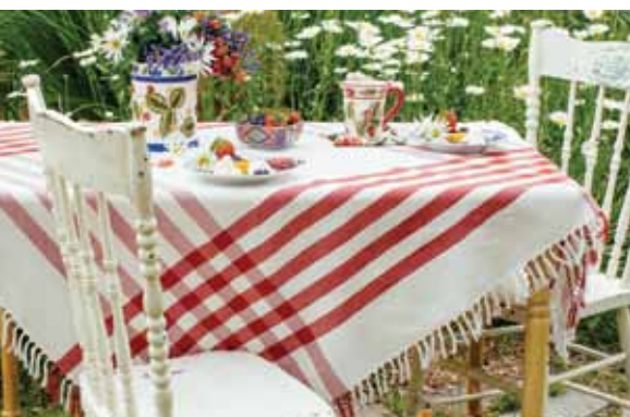
happy picnic gingham tablecloth Hand-knotted fringe TPWHAPY 54x54" $36 60x90" $64