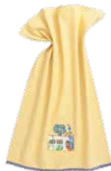
cottage embroidered tea towel in provence TTECOT1Y approx. 19" x 27" $19