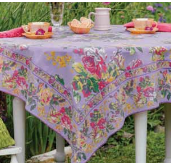
victorian rose tablecloth in lavender TPVICY 36x36" $24 54x54" $46 60x90" $64