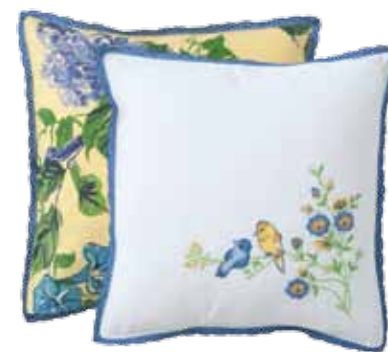
birdy embroidered cushion in white Front & back shown. CPEBIRDY 12x12" $39

A quick way to redecorate, our cushion covers and cushions mix and match with many pieces in our collections. They provide wonderful accents to living rooms and family rooms, bedrooms and patios—any place where the right dash of color will create the mood you're seeking. Cushion covers are sold without fillers, which can be purchased separately. All are 100% imported cotton.