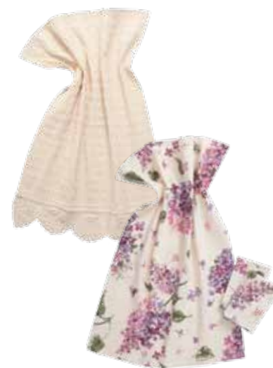
luxurious honeycomb tea towel, lilac tea towel & little dish cloths in ecru Sets of two. TTLUXH1Y tea towels $18 TTLILY tea towels $20 TD2LILY little dish $10