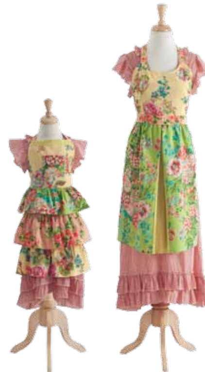
festival patchwork mommy & me aprons Sold separately. APFESY adult apron $34 APKFESY kids apron $24

wonderfully colored prints to enhance your laundry room or bedroom. 100% imported cotton in some of this season's most favorite patterns.