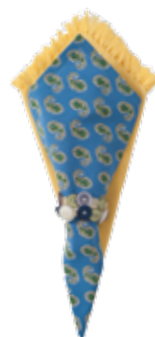
jamavar napkin in periwinkle Sets of four. NPJAM20Y napkins $29 NPESS18Y essential napkin in yellow $22