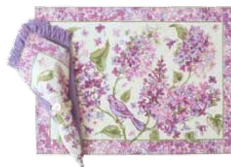
lilac placemats & napkins in ecru Sets of four. MPLILY placemat $48 NPLIL20Y napkin $29 NPESS18Y essential napkin in lilac $22