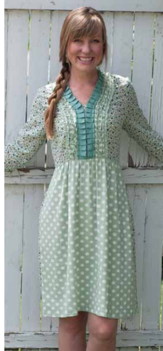
penelope dress The Penelope is such an adorable little style I can barely stand it! A variety of limited availability fun fabrics create a fabulous mix and match effect that you will not find anywhere else. 50's era polka dots on the skirt and calico prairie flowers on the body are highlighted with solid and printed ruffles and fold over pleating at the center of the bodice. Imported cotton jersey skirt, imported cotton crepe and jersey body. Tie. DRA5070Y XS-XL $98