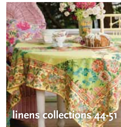
linens collections 44-51