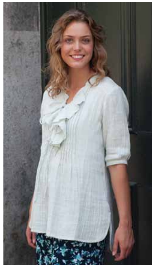
dawn blouse The perfect peasant shaped blouse for an easy going, beautiful style. Crafted with a fabulous ruffle below the split neckline and cinched with a fabric tie, the Dawn Blouse is further embellished by six rows of fine pintuck detailing and is lightly gathered below for a nice relaxed fit. Imported cotton. Pale aqua. BLA5024 XS-XL $79