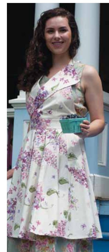
lilac collar apron Our shirt collar aprons perfectly channel vintage 1940's feminine styling in a way that we just can't get enough of! Imported cotton. APCLILY $39