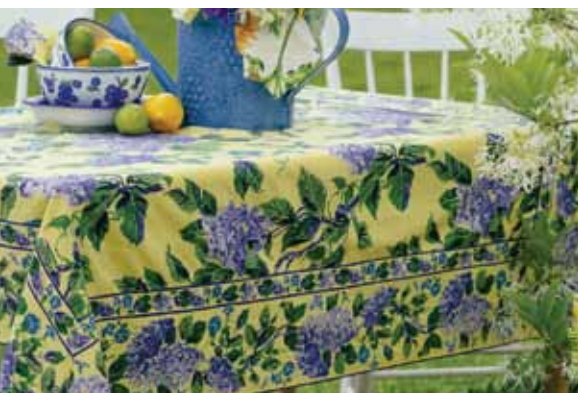
harriet's hydrangea in yellow TPHYDY 36x36" $24 54x54" $46 60x90" $69 60x108" $89 88" round $89

the beckoning sunny yellows and sparkling sea blues of provence transform your home into french country style.