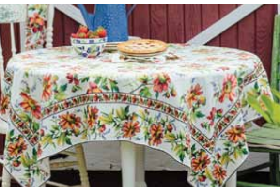
friendship tablecloth TPFRDY 36x36" $24 54x54" $46 60x90" $69 60x108" $89 88" round $89

— picnics and family outings, backyard barbecues and informal get-togethers, long days and cool evenings on the porch are calling.