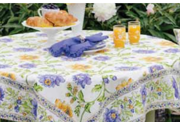
rosehip tablecloth in ecru TPRHPY 36x36" $24 54x54" $46 60x90" $69 88" round $89