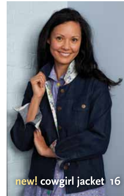
new! cowgirl jacket 16

magnolia dress This is such a lovely feminine dress! Made in our 100%, skin soft Indian cotton, the Magnolia is a “go-to” piece for today's woman. A lively, nature inspired wild-flower print is enhanced by delicate crochet lace lining the collar while the bodice is decorated with eight of our signature accordion pleats. Side-slit pockets. Tieback. Imported cotton. DRAA5086Y XS-XXL $89 W1-W2 $99