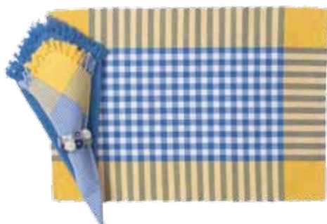
canary plaid placemats & napkins in provence Sets of four. MPWCANY placemats $32 NPWCAN18Y napkins $26 NPESS18Y essential napkins in periwinkle $22