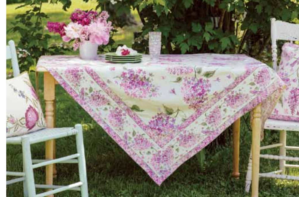
lilac tablecloth in ecru TPLILY 36x36" $24 54x54" $46 60x90" $69 60x108" $89 88" round $89

Decorate your home with the simple serenity inherent in one of our loosely drawn, watercolor-inspired prints. Based on April's artwork, the Lilac print, featuring wildflower florets, buzzing bees and sweet songbirds, bring the peace of nature indoors in an irrepressibly cheerful manner. Imported cotton.