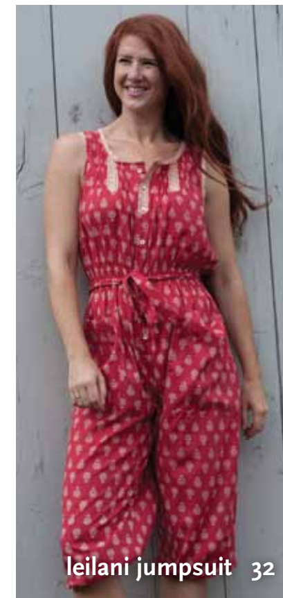
leilani jumpsuit 32