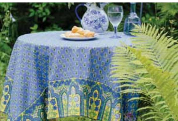
jamavar tablecloth in periwinkle TPJAMY 54x54" $46 60x90" $69