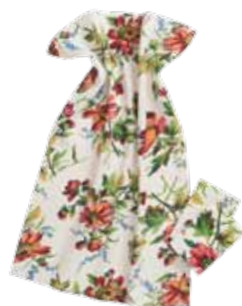
friendship tea towel & little dish cloths in ecru Sets of two. TTFRDY tea towels $20 TD2FRDY little dish $10