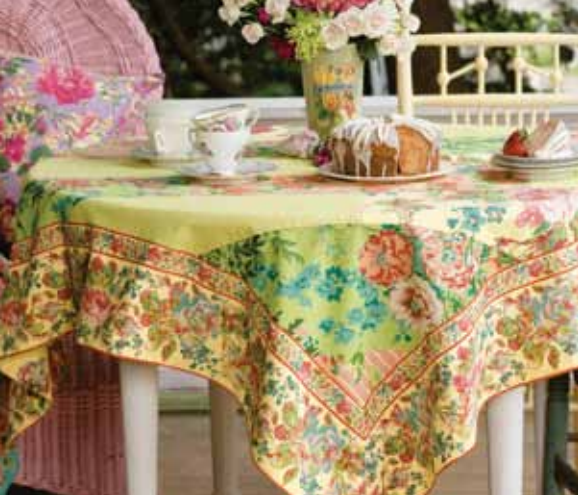
festival patchwork tablecloth TPFESY 54x54" $99