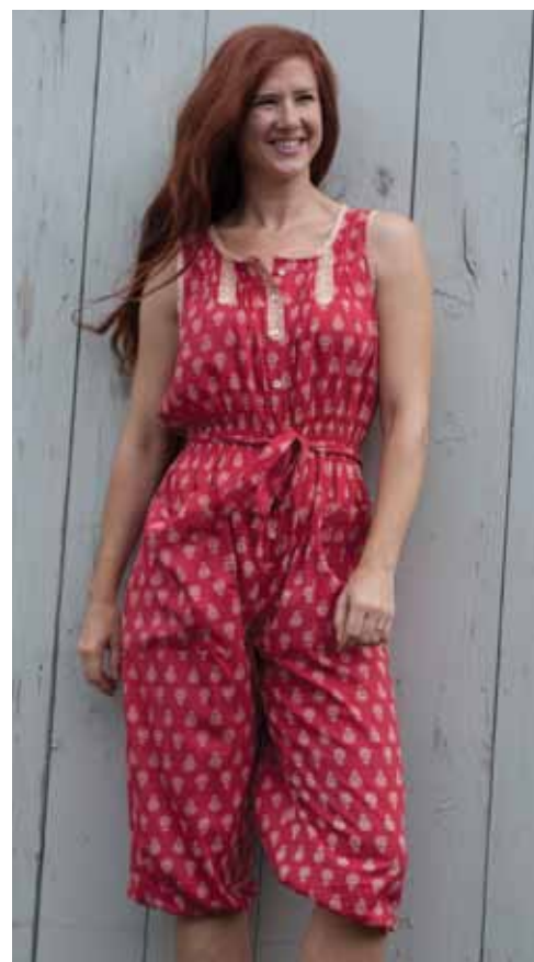
leilani jumpsuit The Leilani Jumpsuit is manifested with one of our classic Indian inspired traditional block prints. Lovely lace artfully trims the button placket, the neckline, and armhole. The brick red color really comes to life in this popular throwback jumpsuit style that is so liberating and fun to wear. Gathered below the waist pockets. Fabric belt. Imported cotton. JSA5231Y XS-XL $109