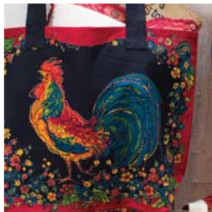
Doodle Doo Market Bag - OS (BG119X.Black)..... $27.00

Matching Cushions and Pillowcases too! See them online at aprilcornell.com