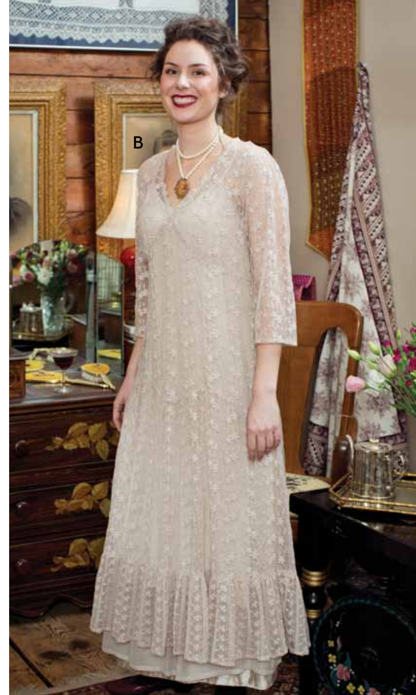
[A] THIS COTTON VELVET TREASURE is destined to become a favorite for fashionistas with a flair for the debonair. The magnificent collar features opulent gold and plum brocade that is to die for, while the plush elegance of the material speaks of autumn nights relished by a roaring fire or evenings spent with friends at the theater or an art opening. Boulevard Coat (JKA5038X.PLUM) .....$189.00 [B] FOR THE FAIRY TALE PRINCESS IN YOU The Dentelle Dress is truly a one of a kind piece. Artfully allover embroidered net is utterly stunning. Details include lace trim at the neckline and beautiful ruffled flounce at the hem. Perfect for a fall wedding, or for stealing the show at a holiday party. Dentelle Dress (DRA5085X.Pewter) ..... $229.00 [C] Dentelle Girls Dress (DR5355X.Pewter) ..... $84.00-$109.00