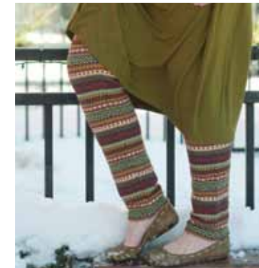
FairIsle Legging (PTA6111X.Harvest) ..... $89.00