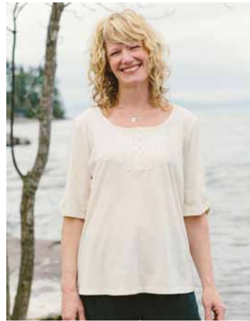
Kitty T-Shirt (TSA5158X.Ecru) ..... $39.00