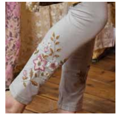
Tapestry Legging (PTA5071X.Pewter)..... $59.00