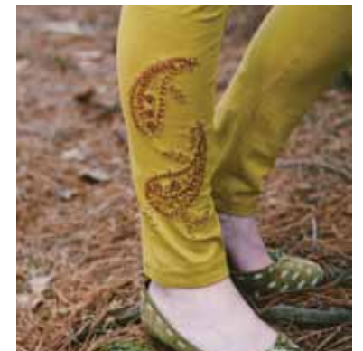
Tapestry Pant (PTA5071X.Mustard) ..... $59.00