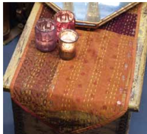
Celebration Brocade Runner (RNCELX.Multi) 13x72" ..... $59.00

[A] CAN LACE BE BOLD AND DRAMATIC? Yes! The Lucie Jacket is a spectacular garment with gorgeous inset lace at the collar that contrasts exquisitely against the black wool. And just look at the matching turned-back sleeves. Lined in our skin-soft rayon shantoon. Lucie Jacket (JKA5041X.Black) .....$149.00