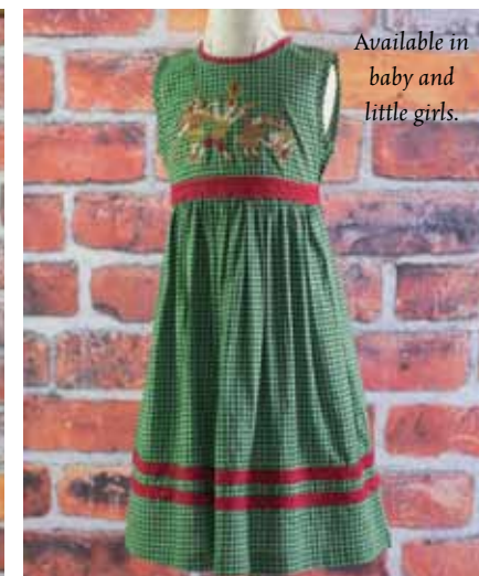
Molly Girls Dress (DR5390X.Green) ..... $54.00-$64.00