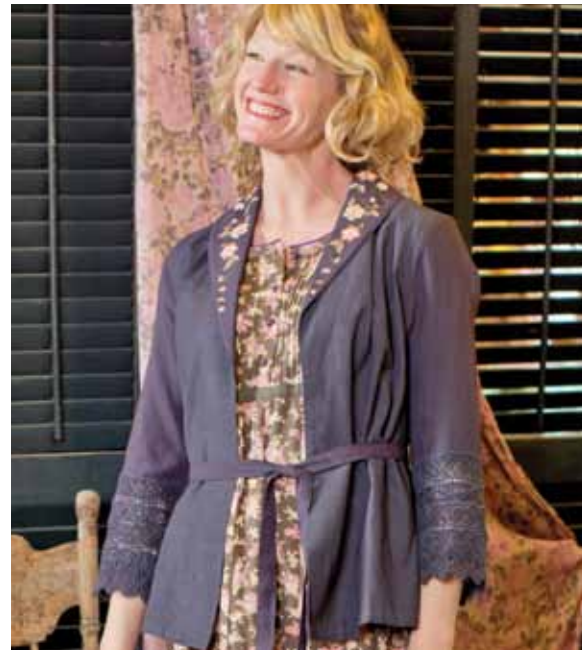
Nicole Ladies Jacket (CUA5053X.Charcoal)..... $89.00