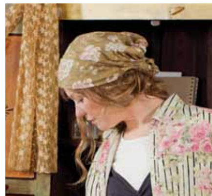
April's Turban (ACA5171X.Olive) ..... $29.00