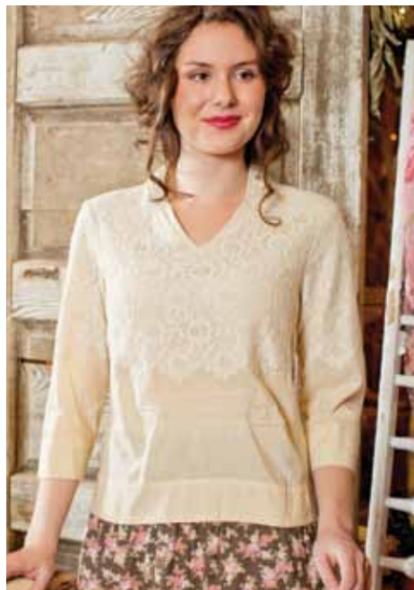
Georgina Blouse (BLA5049X.Antique) ..... $79.00

April Cornell believes in making every day special, and that means making everyday clothes special too. These wardrobe "basics" are anything but plain, filled with little details like floral tone-on-tone embroidery, cotton lace, pleats and crochet trim. Wearing them will make you feel a little more confident and feminine.