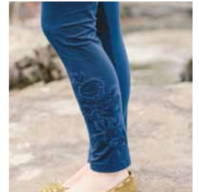
Tapestry Pant (PTA5071X.Indigo)..... $59.00