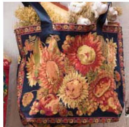
Sunflower Market Bag - OS (BG122X.Black)..... $27.00