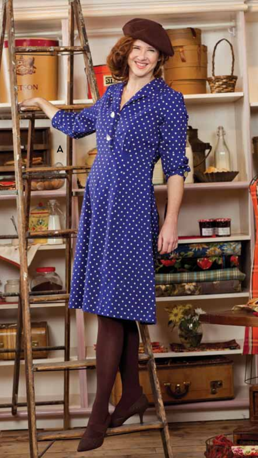
[A] THE DOTS DRESS IS BACK! Whether your style is uptown, downtown or small town, you will look great in our Dots Dress. No-fuss cotton with giant mother of pearl shell buttons below an easy shirt-collar top. Dots Dress (DRA5081X.RoyalBlue) ..... $98.00