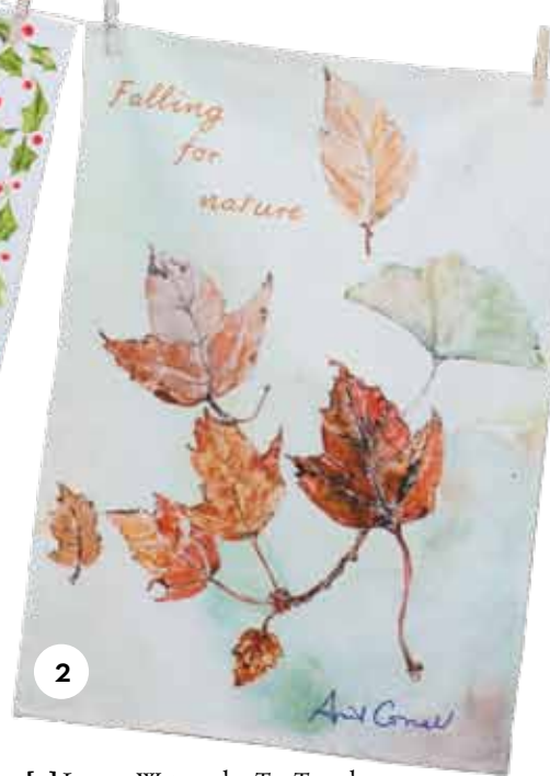
[2] Leaves Watercolor Tea Towel (TTLEAV1X.Green)..... $18.00