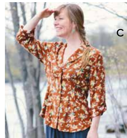
Shown with: Dancing Dress (DRA5190X.Black) ..... $89.00