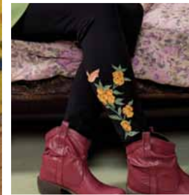
Tapestry Pant (PTA5071X.Black) ..... $59.00