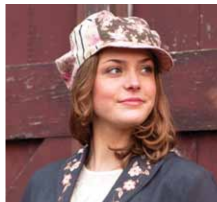
April's Patchwork Thinking Cap (ACA5171X.Rose) ..... $34.00