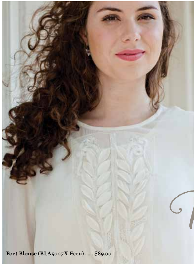
Poet Blouse (BLA5007X.Ecru) ..... $89.00