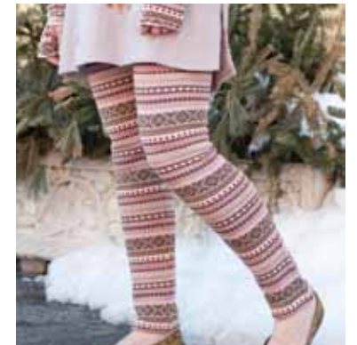
FairIsle Legging (PTA6111X.Rose) ..... $89.00