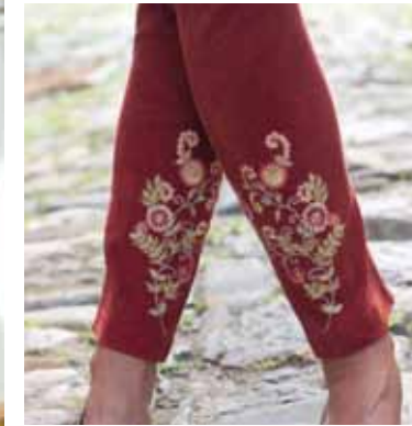
Florence Pant—Corduroy (PTA5140X.Rust)..... $79.00