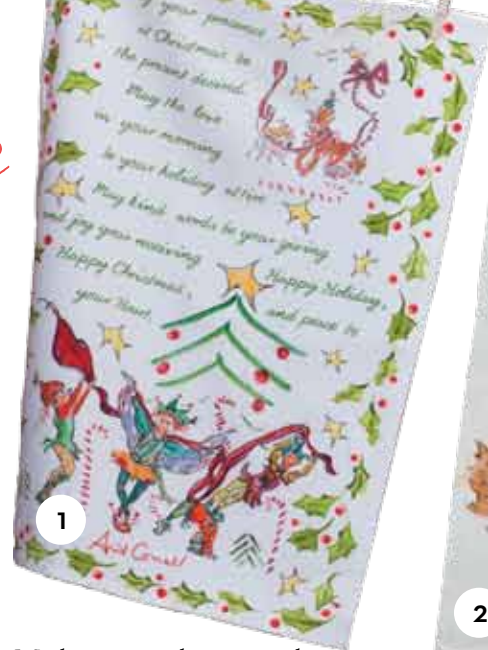
[1] Elves Watercolor Tea Towel (TTEWAT1X.Multi)..... $18.00