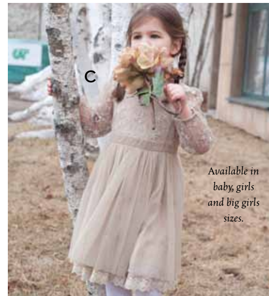
Available in baby, girls and big girls sizes.