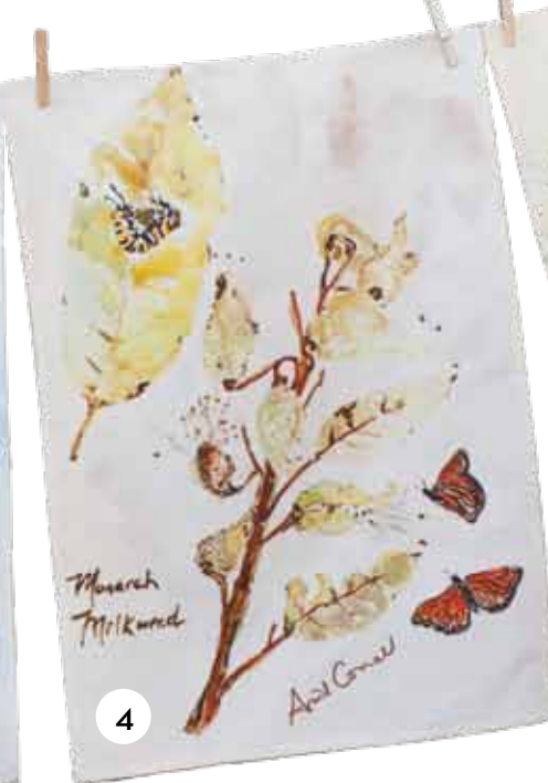
[4] Milkweed Watercolor Tea Towel (TTMILK1X.Ecru)..... $18.00