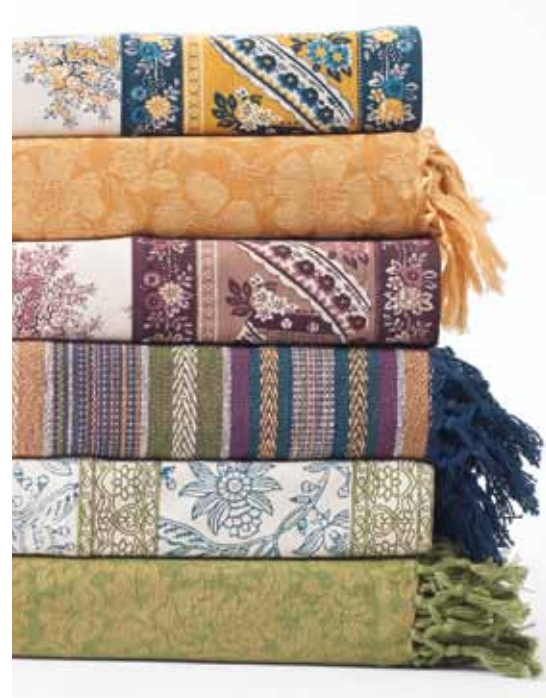
You really need to check out this season's collection of bright, beautiful tablecloths – there's no easier way to give your home a new look for Fall. Top to bottom: Marseille Tablecloth in Gold, Peony Jacquard in Gold, Marseille in Rose, Tribal Weave, Mela in Teal, Melody Jacquard in Green.