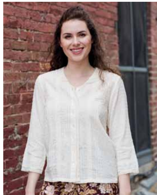
Melody Blouse (BLA5006X.Ecru) ..... $79.00

April Cornell believes in making every day special, and that means making everyday clothes special too. These wardrobe "basics" are anything but plain, filled with little details like floral tone-on-tone embroidery, cotton lace, pleats and crochet trim. Wearing them will make you feel a little more confident and feminine.