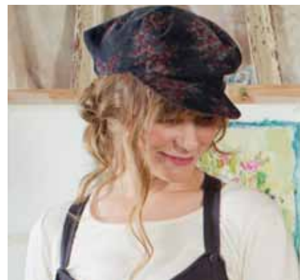
April's Thinking Cap – Corduroy (ACA5201X.Navy) ..... $34.00

A fun, creative accessory for the bohemian spirit who is young at heart. A colorful mix of prints and the embroidered words "thinking cap" on the back form the basis of this artistic treasure.