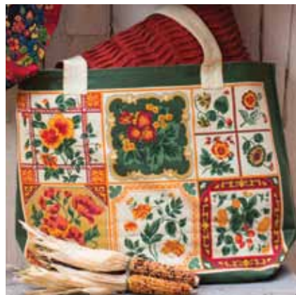
Tile Market Bag - OS (BG121X.Ecru)..... $27.00