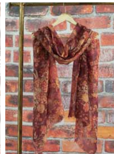
Zinnia Garden Shawl —Wool gauze (SF5192X.Chocolate) ..... $84.00