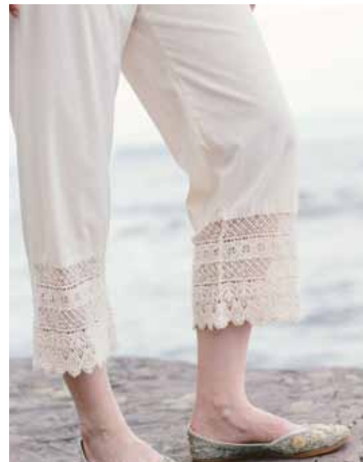
Pantaloon Pant (PTA5055X.Ecru) ..... $59.00