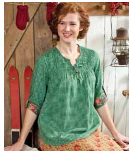
Molly Blouse (BLA5164X.Green) ..... $69.00

[A] THIS BEAUTY IS BOTH BOLD AND DELICATE The Anna Blouse is a garment of delicate beauty requiring intricate craftsmanship. Remarkable embroidery, rows and rows of pleats, and the illusion of layers all combine into a daring statement. The shell is cotton/nylon; the camisole is in comparably soft rayon shantoon. Anna Blouse (BLA5184X.Rust)..... $98.00 [B] The matching Anna Skirt with its elegant pleats and embroidery can be worn on its own with a simple top to make a dramatic statement; or wear it with the Anna Blouse—wow! Anna Skirt (SKA5034X.Rust) ..... $109.00