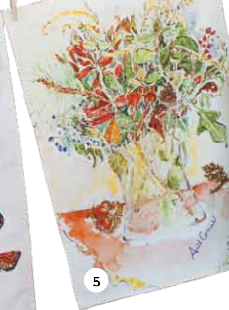
[5] September Watercolor Tea Towel (TTSEPT1X.Multi)..... $18