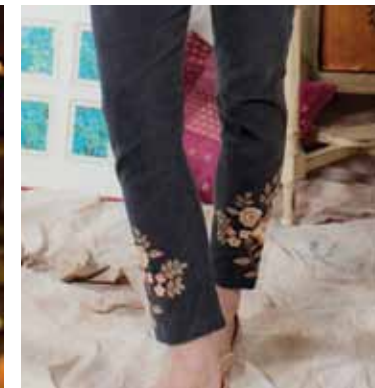
Florence Pant—Corduroy (PTA5140X.Charcoal) ..... $79.00

Lovely Leggings to Layer Superior quality, comfortable fit, and of course feminine details to make you feel your best.